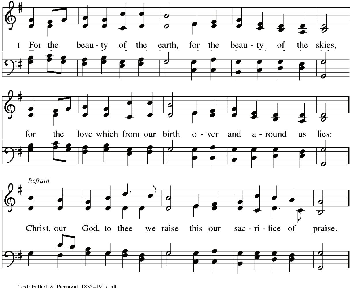
Text: Folliott S. Pierpoint, 1835–1917, alt. Music: DIX, Conrad Kocher, 1786–1872